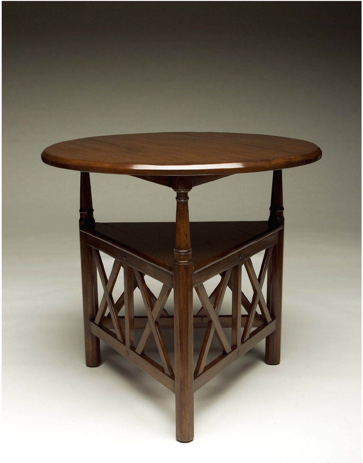
"African Mahogany" on African Mahogany