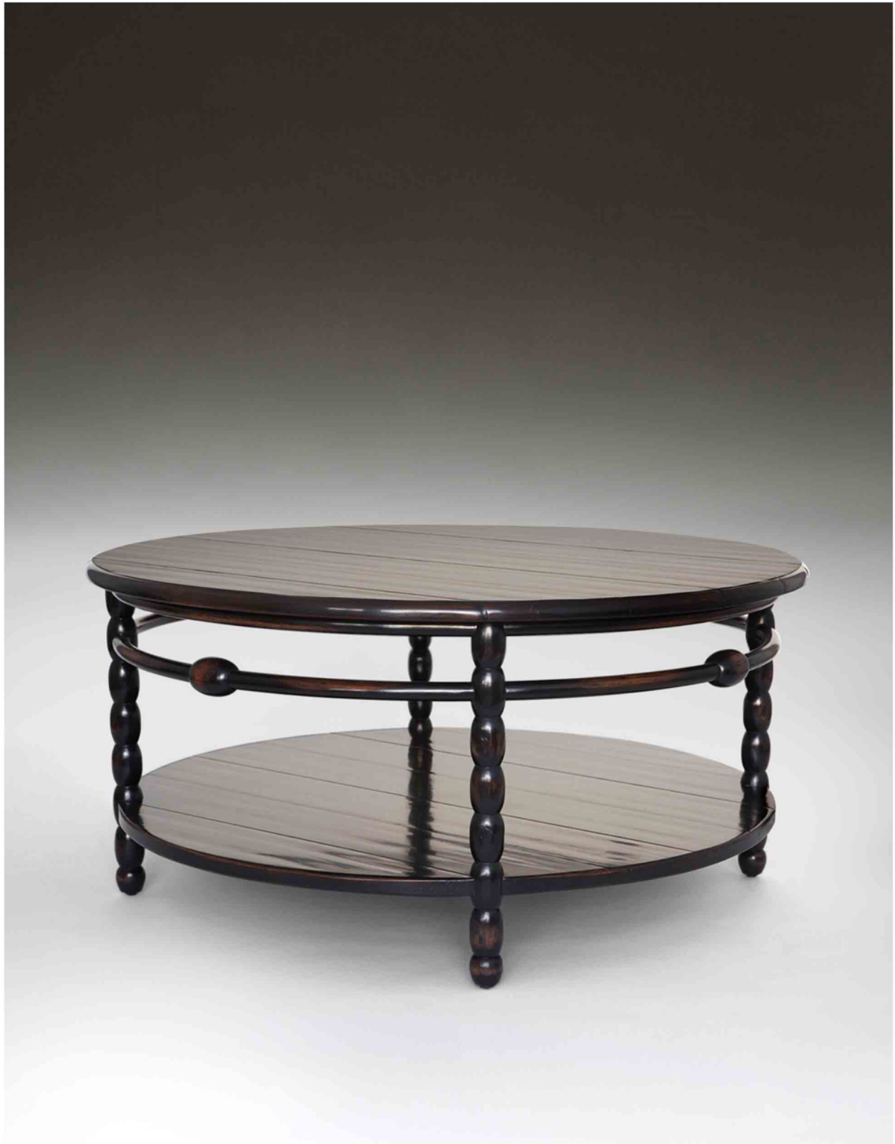
"Worn Ebonized Beech" on Alder