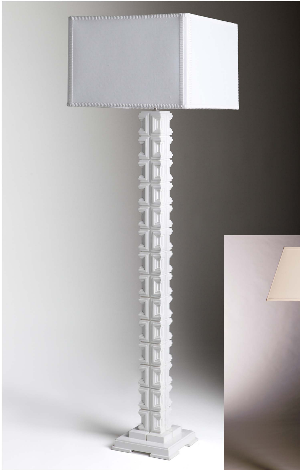
Polished White Lacquer