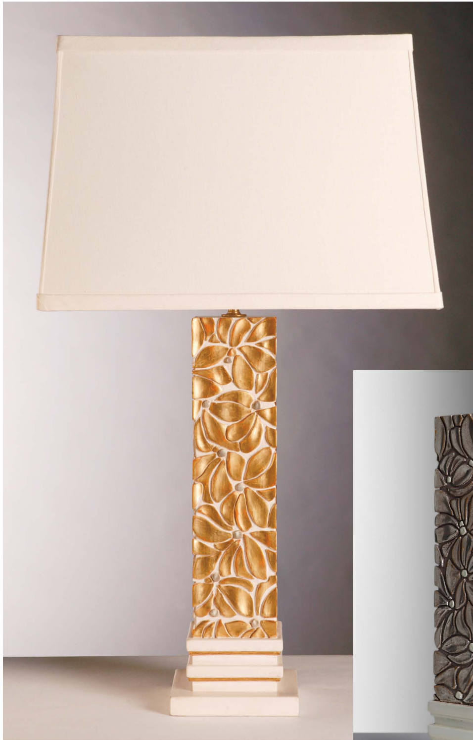
Yellow Gold over Milky Gesso