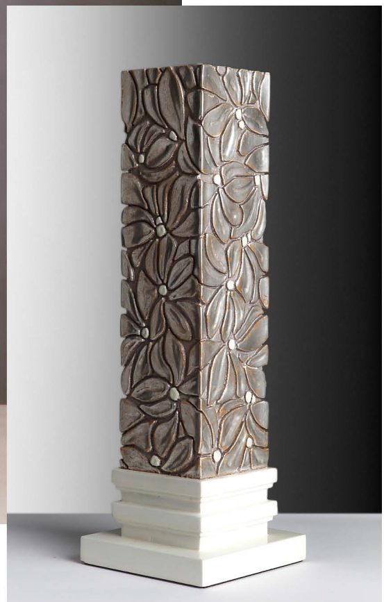
White Gold w/ Polished Ivory Lacquer