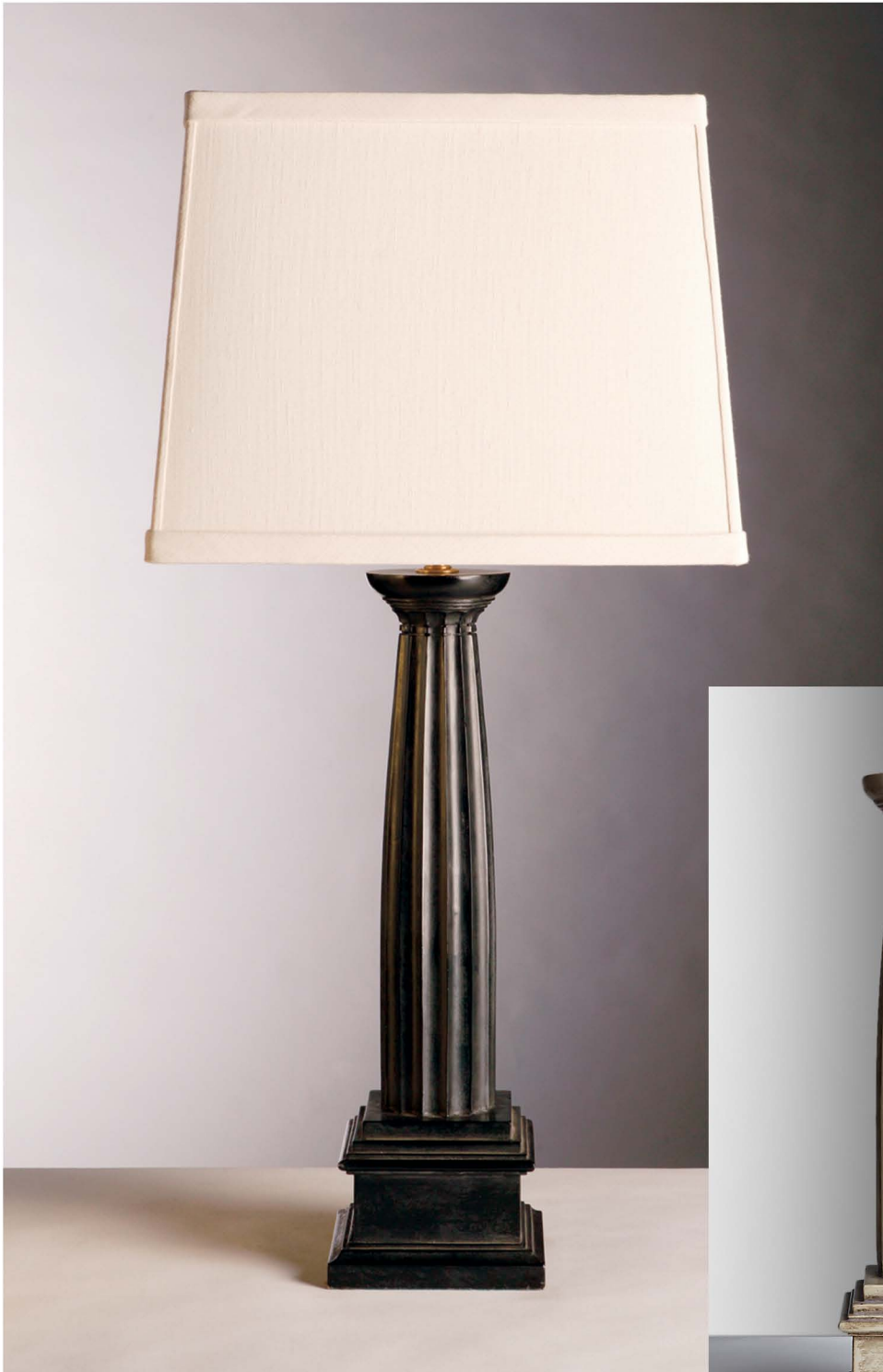
Honed Black Lacquer